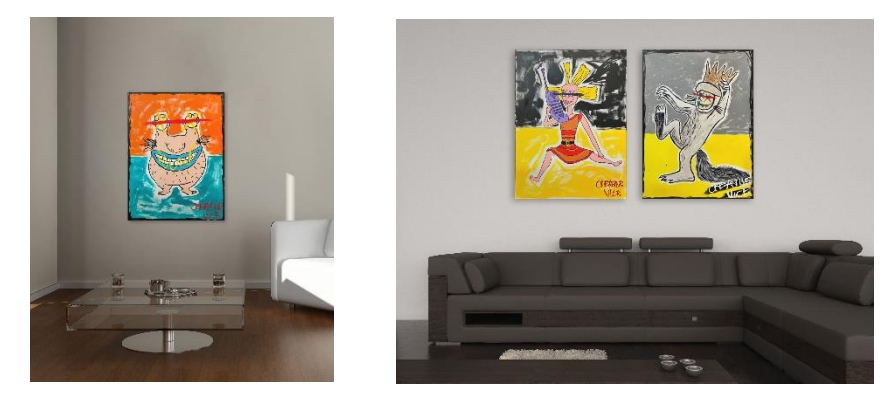
Artspace Warehouse is one of the world's leading galleries for savvy contemporary art collectors . With galleries in Zurich and Los Angeles, Artspace Warehouse specializes in guilt-free international urban, figurative, pop, graffiti and abstract art.